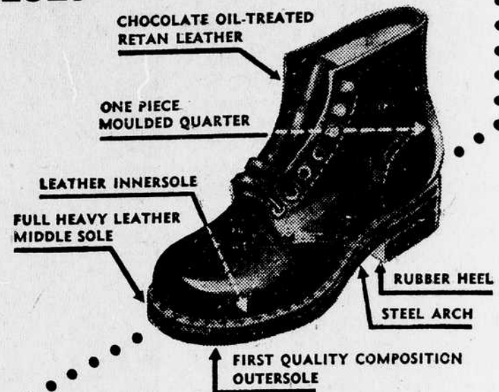
BROWN ELK-FINISHED COWHIDE