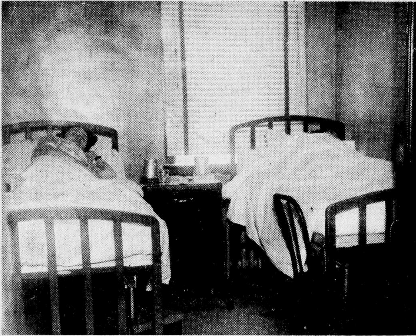
In order to care for as many people as possible, practically all private rooms at Marion Hospital have been converted to semi-privates. Here a 9x13 room originally built for one bed, is used by two patients, who share a bedside table. When both patients have visitors at the same time, the room is even more crowded.