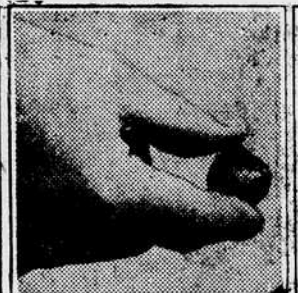
SCILLA - 3 INCHES