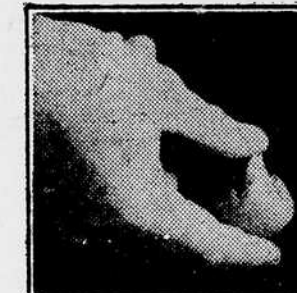
CROCUS - 2 INCHES