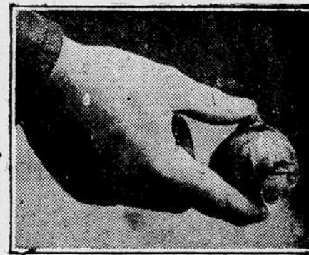
HYACINTHS - 6 INCHES