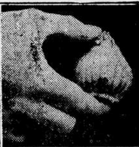
DAFFODILS - 6 INCHES

Botanists say that a bulb is "a store house containing a new plant, plus food and energy sufficient to carry it to maturity." Bulbs are much older and stronger than seeds, and better equipped to withstand the hazards which beset all infant plants. But there are some conditions which will destroy them and these must be carefully avoided when you plant bulbs this fall. The chief enemy of bulbs is poor drainage; in wet soil they will decay and this causes most failures with garden bulbs. If there is any doubt about your soil being well drained, raise the bed six inches or more above the surface before planting.