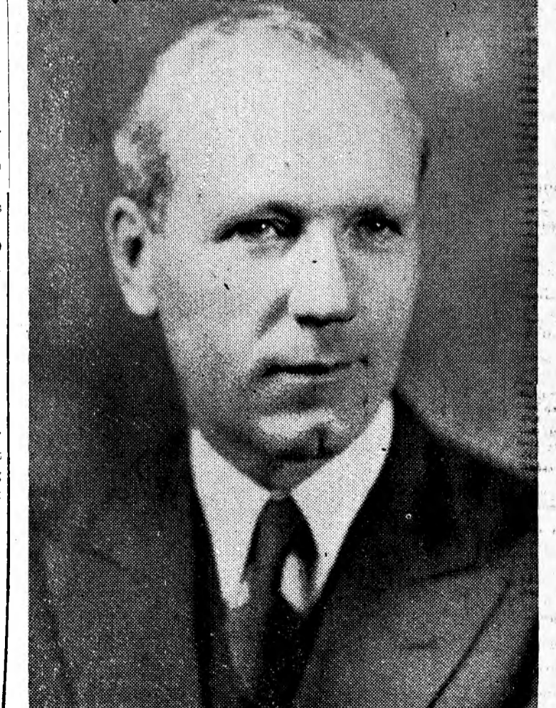
The Honorable Angus Macdonald, Premier of Nova Scotia, and wartime minister of the Canadian navy, who will make the principal address at the afternoon program of the semi-centennial celebration at Flora Macdonald college on Tuesday, May 7th.