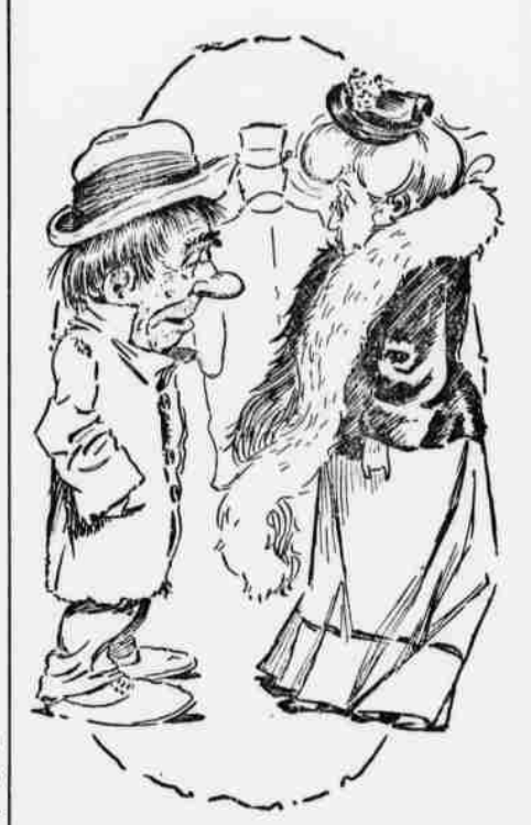
A Had Been.

Two-thirds of the offerings received go to the officiating clergymen and the balance to the Pinehurst Educational Fund.