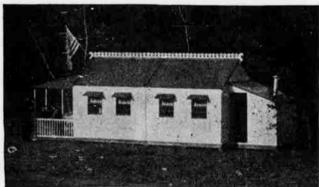
TWO-ROOM COTTAGE WITH KITCHEN ELLS AND STYLE C PORCH. $225.00.

Just what is wanted at Southern winter resorts.