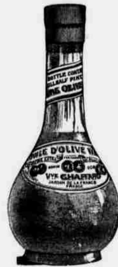
Full Half Pints