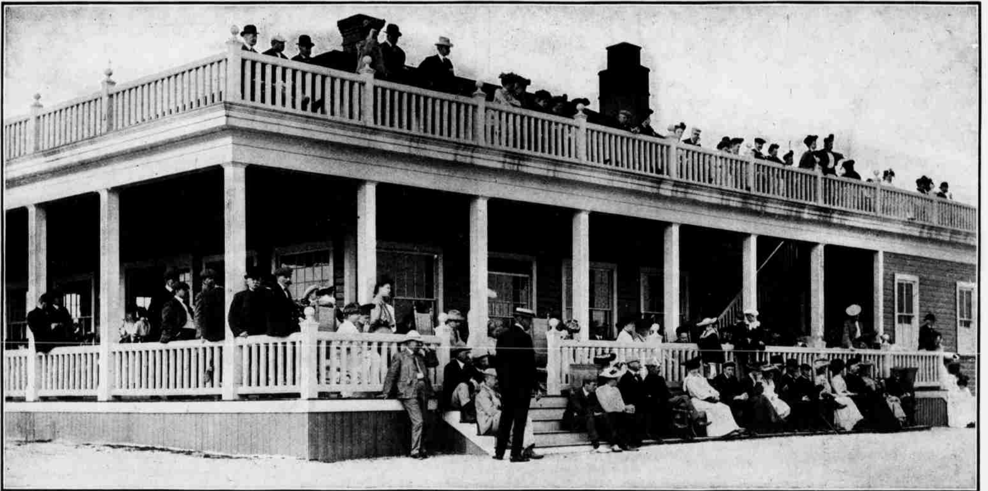
SATURDAY AFTERNOON AT THE GOLF CLUB HOUSE.

Situated a bit apart from the centre of the Village is a Central Station or complete Power Plant, which furnishes heat, light and water for the entire Village, and power for the Electric Railroad, Ice Making Plant, Cold Storage Refrigerators, elevators, etc. In the manufacture of artificial ice only pure Pinehurst Water is used and great attention is given to cleanliness.