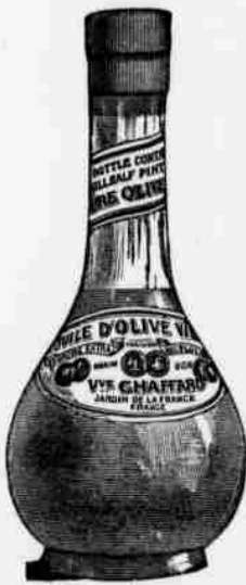
Full Half Pints