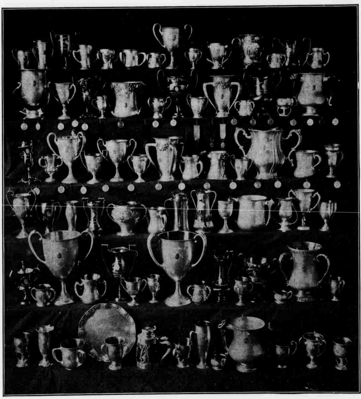
TOURNAMENT TROPHIES FOR SEASON OF 1904-05.

The Pinehurst Electric Railroad is connecting with trains at Southern Pines, (Pinehurst Junction,) as usual.