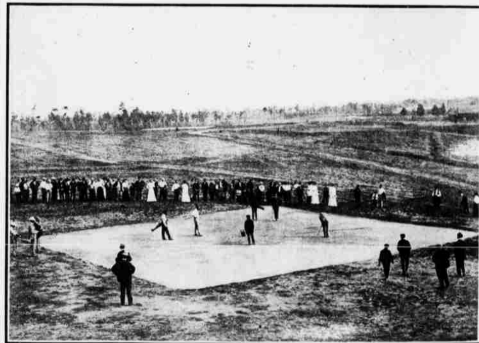
A CLOSE FINISH ON THE HOME GREEN.