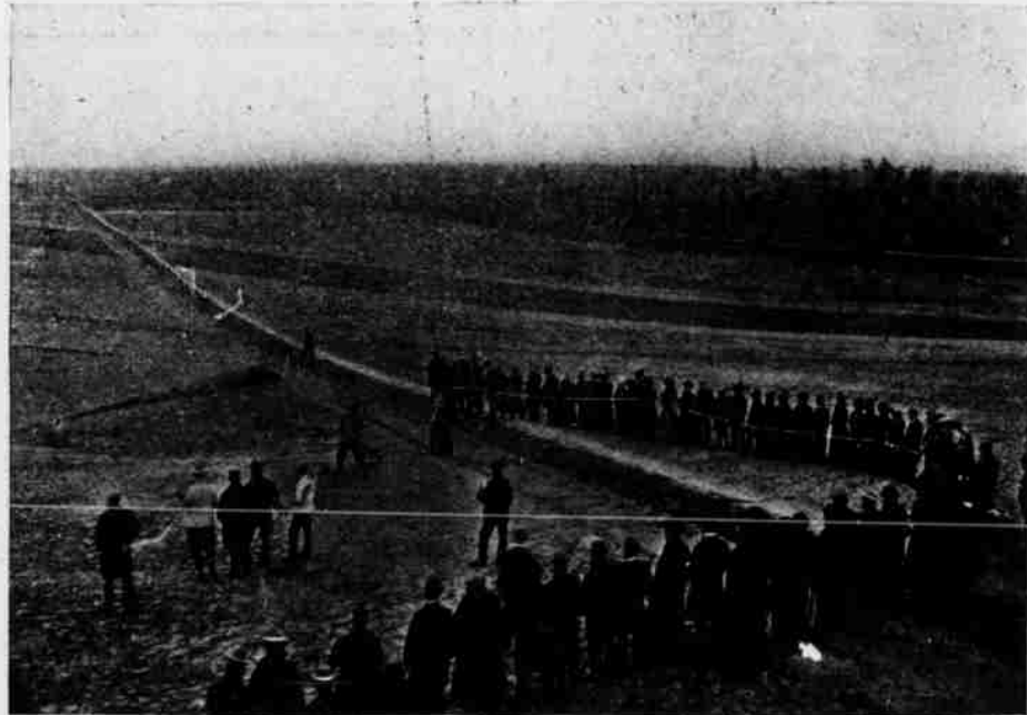
THE START IN THE FINALS.