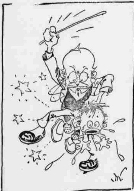
WHAT FARM IMPLEMENT IS THIS?