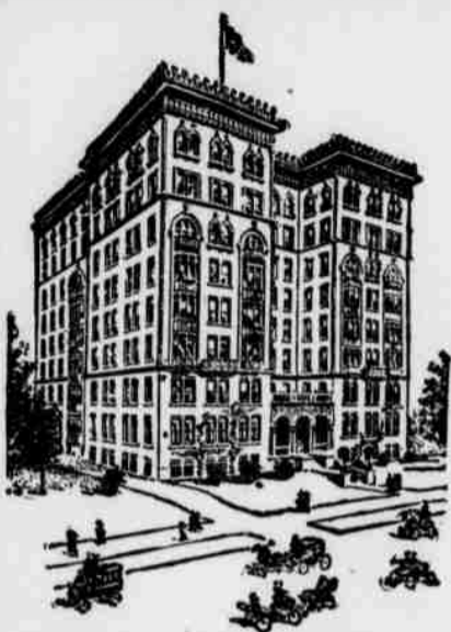
North St., at Delaware Ave.