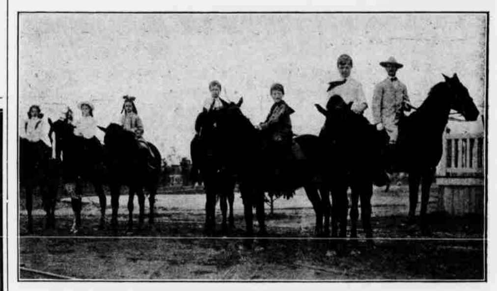
READY AND EAGER FOR A FROLIC.

Upon several occasions events have also been arranged for those who ride. with the equestrian gymkhanas, and in in the way of simple tests, such as the which there has been rollicking fun from | lance and ring contest, in which hanging rings are pierced with a long stick while Not only are there the familiar sack, riding about a ring; the potato race, in