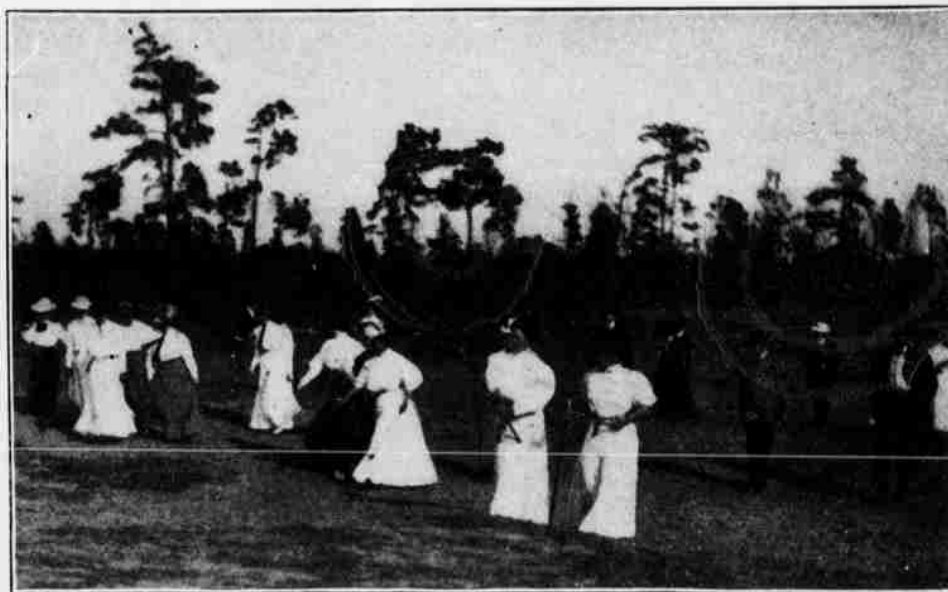
THE JOYS OF MONKEY GOLF.