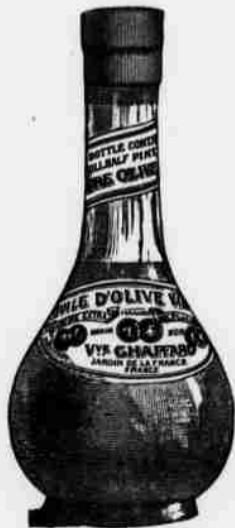
Full Half Pint