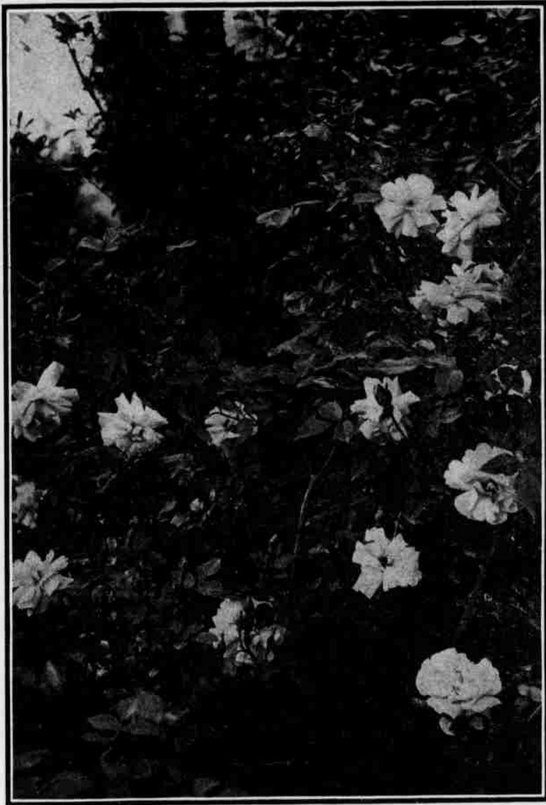
THE CHEROKEE ROSE.