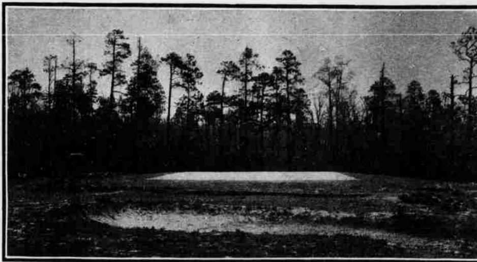
FROM THE TEE—THE APPROACH.

largely through the interest of the Village Club which has contributed liberally towards its support and also provided for its furnishing. Affording, as it does, a close range view of the children it will be a popular visiting point.