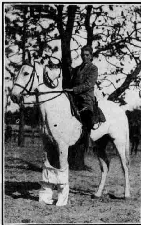
IN BONNET AND OVERALLS

The new garage with a capacity for thirty machines is complete; one of the best equipped in the south.