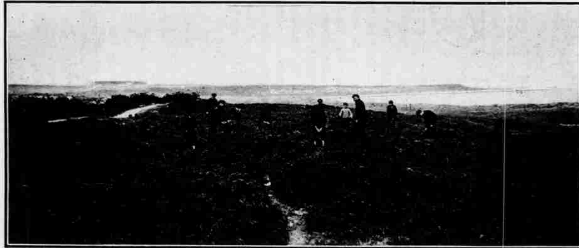
TYPICAL OF THE "WHINS"—3RD HOLE