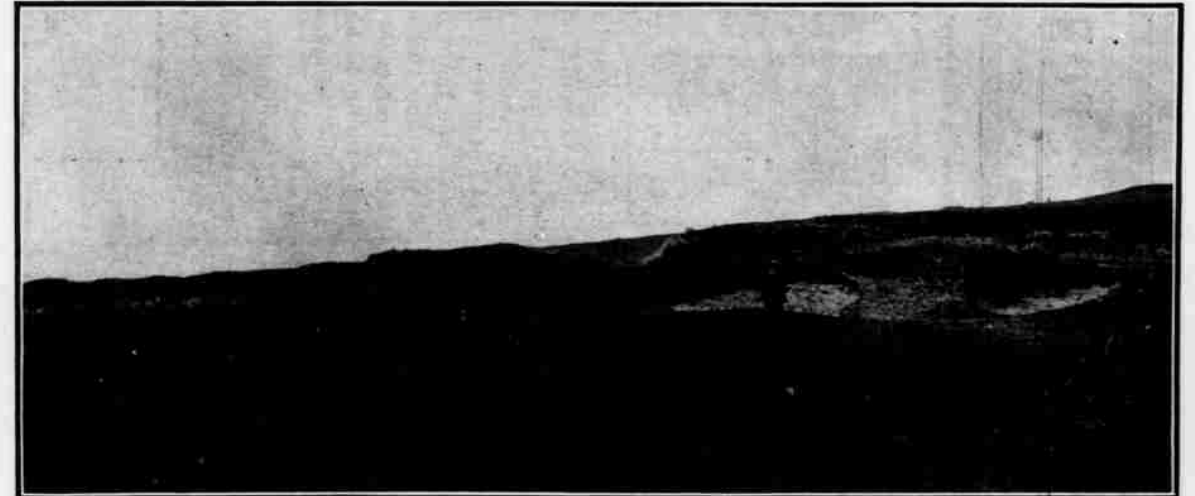
HILLOCK'S COVERING THE FAIR GREEN—9TH HOLE