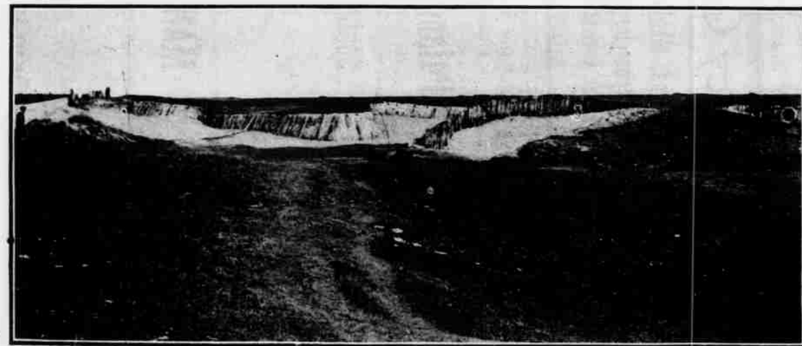
A 135-YARD TEE CARRY—BUNKER 6 FEET HIGH IN MANY PLACES—2ND HOLE