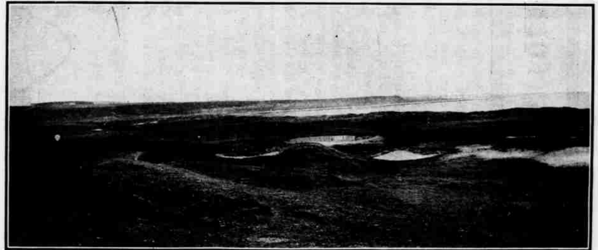
TYPICAL OF UNDULATING FAIR GREEN—11TH HOLE