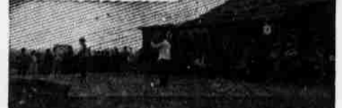
"Shooting Off" a Tie at The Pinehurst Gun Club

E. I. DUPONT DE NEMOURS POWDER CO. Est 1802 WILMINGTON, DELAWARE.