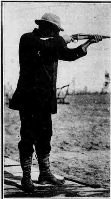
BANDMASTER SOUSA AT THE TRAPS

A merry group enjoyed the first of the Saddle picnics Thursday.