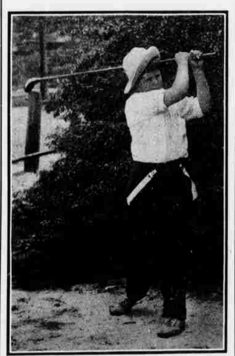
THE GOLF CALENDAR LAD'S DOUBLE

Two baseball games planned for the coming week, are being anticipated by the entire Village.