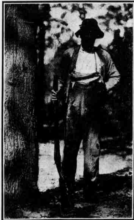
A NATIVE HUNTER