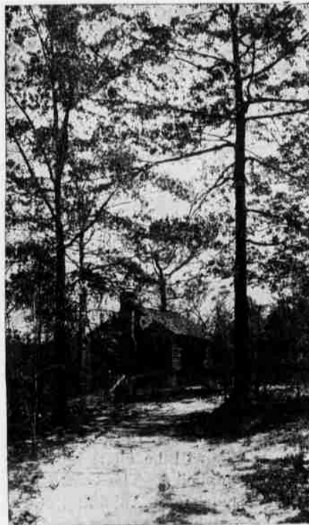
"HIGHWAYS AND BYWAYS"

In Wednesday's ball game The Carolinas broke a tie score at eight in the sixth inning for a winning run in the seventh and last.