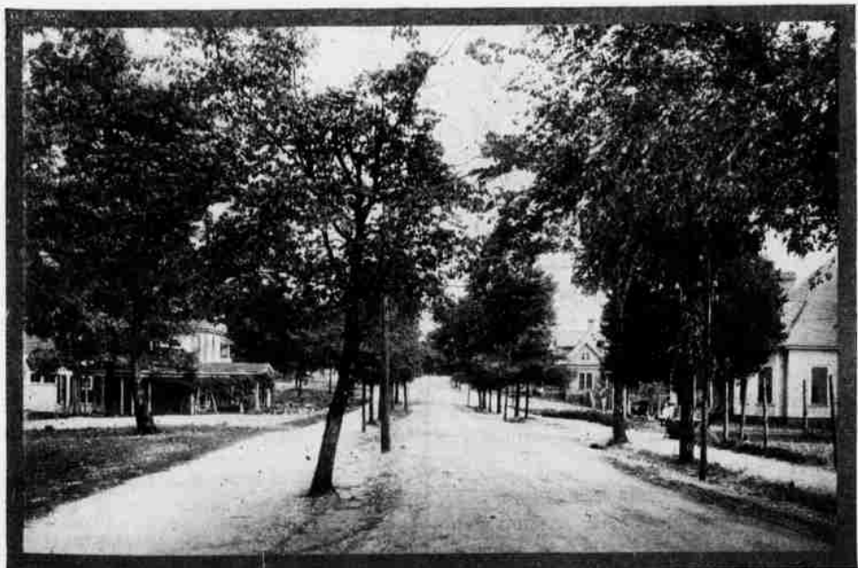
ELM STREET—ALONG THE RIDGE