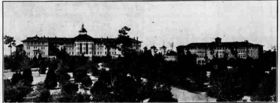
THE NEW ADDITION CONTAINS SIXTY-TWO BED ROOMS, EACH WITH PRIVATE BATH, AND SIXTEEN SLEEPING PORCHES

Every modern comfort and convenience, including elevator, telephone in every room, sun rooms, steam heat night and day, electric lights, pure water, and a perfect sanitary system of sewerage and plumbing.