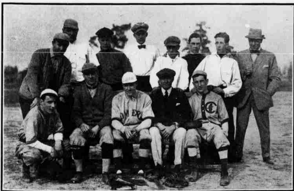
THE VILLAGE TEAMS

Don't miss it, not even if you happen to be contemplating a trip to Baden-Baden at the present moment.