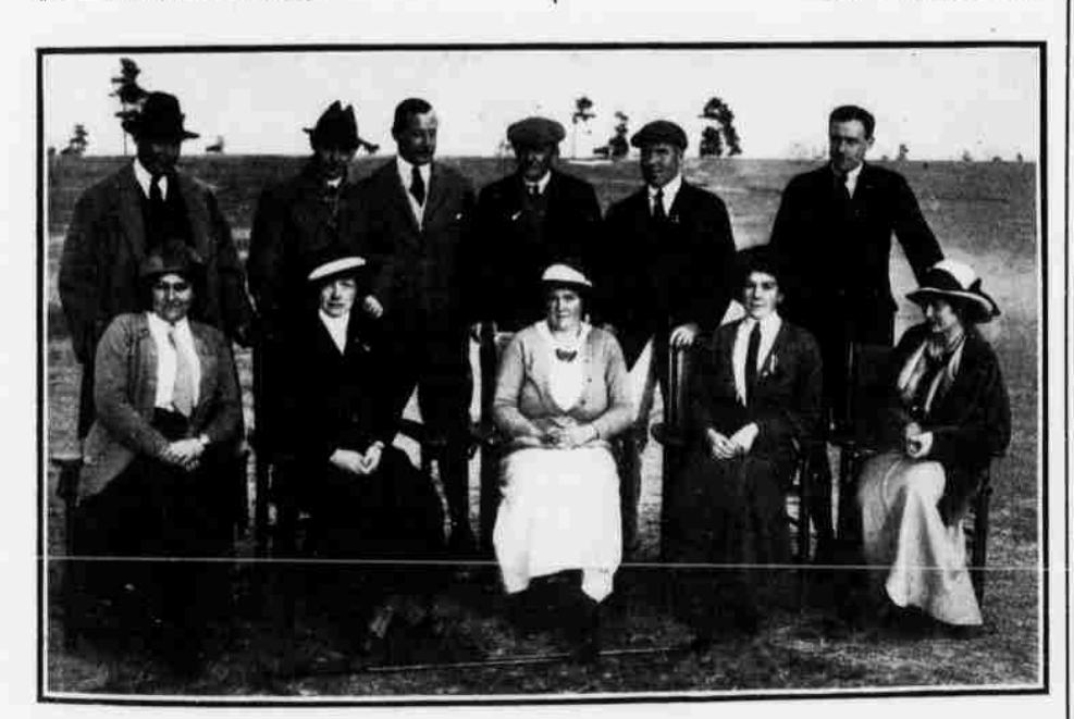
"AMERICA VERSUS THE WORLD" -LAST YEAR'S INTERNATIONAL GOLF MATCH