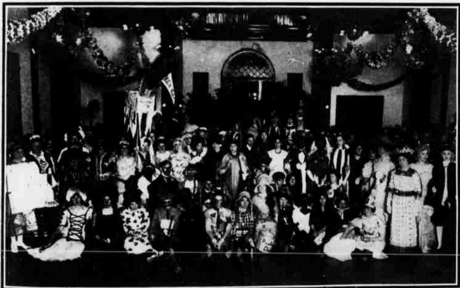
THE 1914 FLASHLIGHT PICTURE

Winchester Shells and Cartridges for Sale at the Pinehurst Store, Traps and Ranges. Look for the big "W" on every Box.