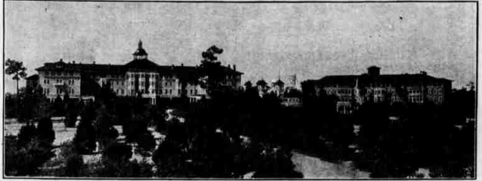
THE NEW ADDITION CONTAINS SIXTY-TWO RED ROOMS, EACH WITH PRIVATE BATH, AND SIXTEEN SLEEPING PORCHES

Every modern comfort and convenience, including elevator, telephone in every room, sun rooms, steam heat night and day, electric lights, pure water, and a perfect sanitary system of sewerage and plumbing.