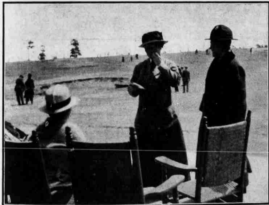
THE TOURNAMENT COMMITTEE