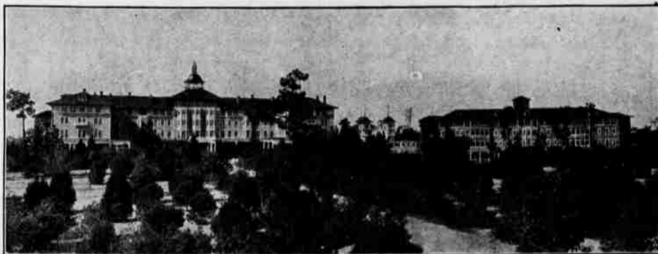
THE NEW ADDITION CONTAINS SIXTY-TWO RED ROOMS, EACH WITH PRIVATE BATH, AND SIXTEEN SLEEPING PORCHES

Every modern comfort and convenience, including elevator, telephone in every room, sun rooms, steam heat night and day, electric lights, pure water, and a perfect sanitary system of sewerage and plumbing.