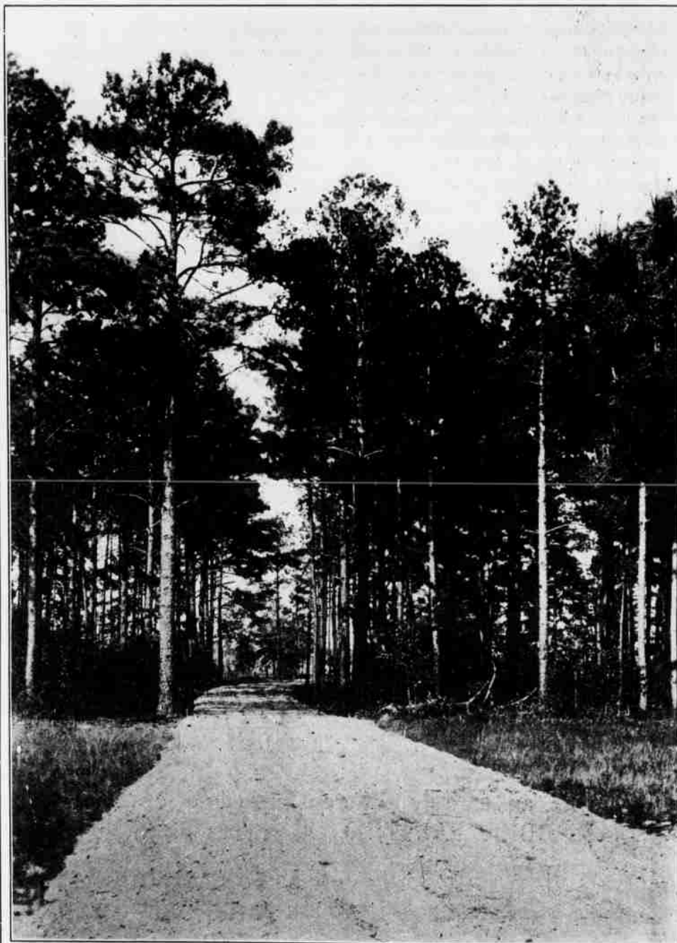
BOSTON TO SAVANAH, NEARING PINEHURST

TWELFTH ANNUAL SPRING—(Pinehurst system)—February 28 to March 4—Gold medal for best qualification score, Presi-