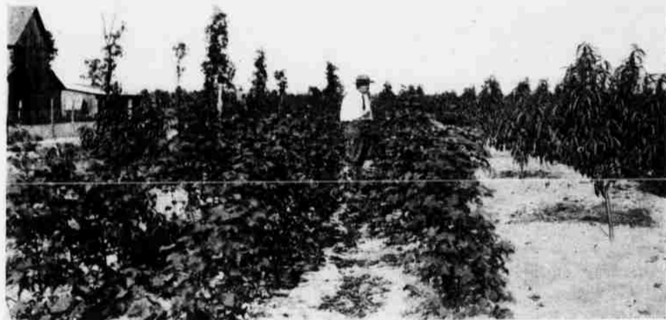
BENJAMIN F. BUTLER IN HIS EXPERIMENTAL PLOT OF LONG STAPLE COTTON

Now for the first time, also, the main roads of the Southeastern States have been logged on the same thorough plan as those of the North have been for sev-