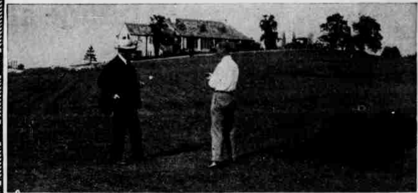
View of a green at Huntington Golf Club, Huntington, L. I. Note pile of Alphano at right of Greenskeeper.

ver you choose to call them, of the respective guests could easily have been gathered and correctly labeled through an inspection of the favors. Golf, shooting and card mementos were as varied as they were numerous and attractive. The virtuoso received a hand-organ; the orator, an oyster; the thirsty man, a camel. Ours was an excellent one with a finely developed hump and appealing plaintive eyes.