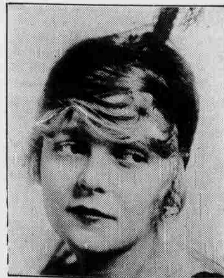
BLANCHE SWEET IN "THE RAGMUFFIN"

with its famous "tango palaces," its Theatre Lane, its great white way is graphically pictured in A. H. Wood's famous stage success "New York," while "Cinderella," the beautiful old fairy tale so well depicted by Little Mary Pickford, is the opposite extreme in life. Which do you prefer? Both can be seen at the Carolina Theatre Wednesday night, February 23rd.