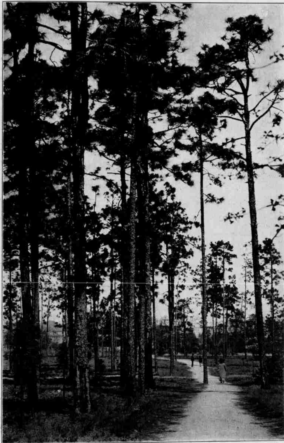
A WOODLAND STROLL

The soft springlike days of the week of February 7th enticed a number of parties from the village and the links into the birchbark and down the wind-