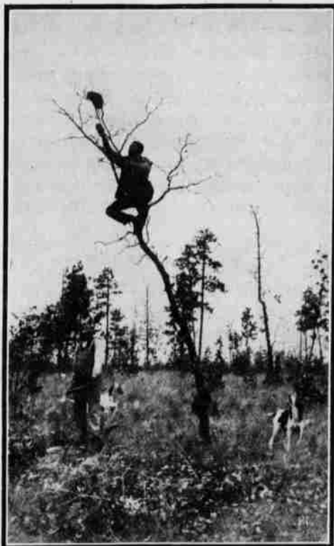
MR. POSSUM UP A TREE