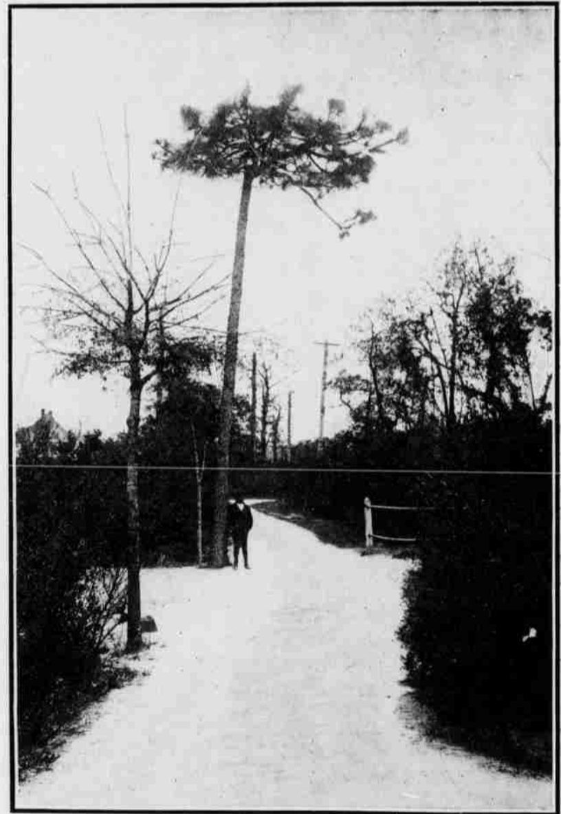
THE SENTINAL PINE