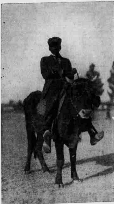
ROMULUS ON BASHAN