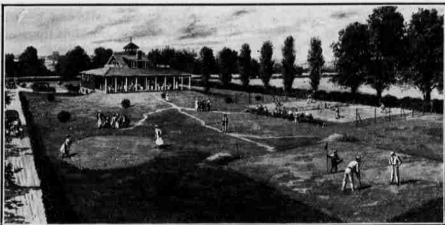
CLUB HOUSE AND EIGHTEENTH HOLE

New York Office, The Bertha Ruffner Hotel Bureau, McAlpine Hotel; any of Cook's Tours, or "Ask Mr. Foster" at any of his Travel Offices.