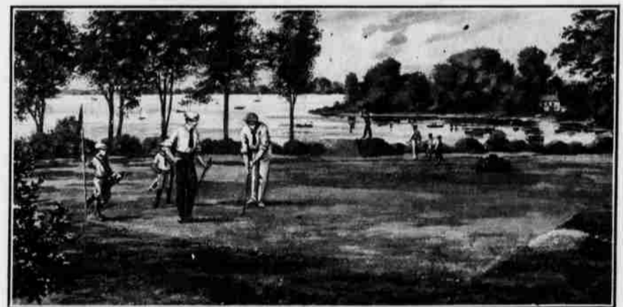
THIRD GREEN AND FOURTH TEE

A NEW EIGHTEEN HOLE GOLF COURSE WILL BE READY FOR PLAY DECEMBER FIRST