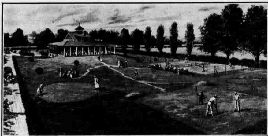
CLUB HOUSE AND EIGHTEENTH HOLE

New York Office, The Bertha Ruffner Hotel Bureau, McAlpine Hotel; any of Cook's Tours, or "Ask Mr. Foster" at any of his Travel Offices.