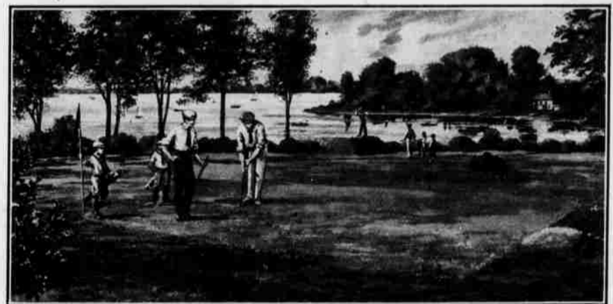
THIRD GREEN AND FOURTH TEE

A NEW EIGHTEEN HOLE GOLF COURSE WILL BE READY FOR PLAY DECEMBER FIRST