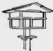
Dodson Sheltered Food House Complete with 8 ft. Pole, $8.00 f. o. b. Kankakee, Ill.