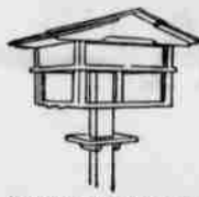
Dodson Sheltered Food House Complete with 8 ft. Pole, $8.00 f. o. b. Kankakee, Ill.