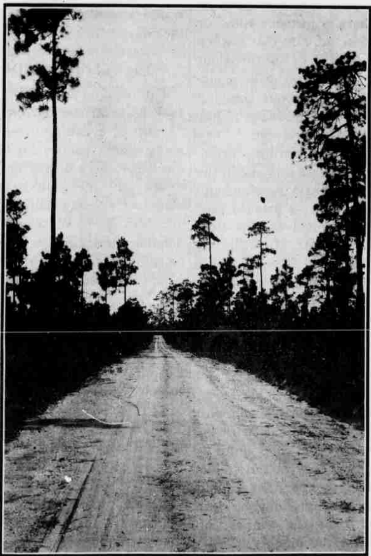
THE BROAD HIGHWAY

All of which we mention only to show that we appreciate the