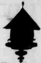
Wren House Price $5.00 f. o. b. Kankakee, Ill.