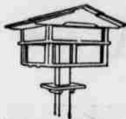
Dodson Sheltered Food House Complete with 8 ft. Pole, $8.00 f. o. b. Kankakee, Ill.