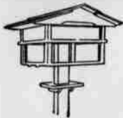
Dodson Sheltered Food House Complete with 8 ft. Pole, $8.00 f. o. b. Kankakee, Ill.