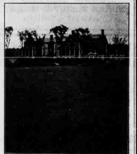
The Nassau Country Club, Nassau, N. Y. Grass Seed supplied by Stump & Walter Co.