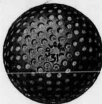
Small Size Non-Floater

S. P. TOWNSEND & CO., 25 Central Av Orange, N. J.