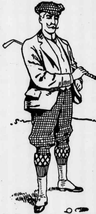
Small Size Non-Floater

New York, 36 Warren Street Boston, 143 Federal Street Philadelphia, 1201 Chestnut Street Chicago, Ill., 36 South State Street San Francisco, 46 Kearney Street.